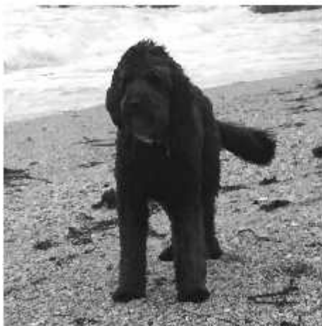
Photo taken moments before he ran at full pelt to the other end of the beach with me in hot pursuit - he was also heading in the direction of the road. Turns out he was off to see if there were any more chips under the tables at the local beach café as there had been the day before. I was breathless when I got to the café to find a disappointed Muttley outside the café - they were closed.....

Scene in Baydon - published by Jo Cooling